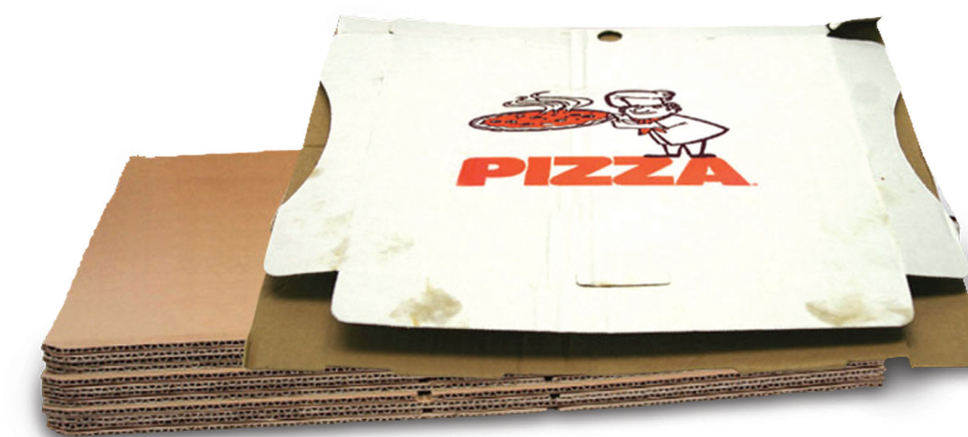
Cardboard boxes Flatten & place large pieces between carts