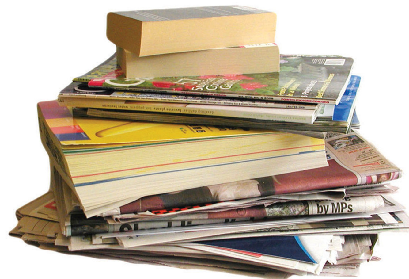
Magazines, catalogues, phone books, soft & hard cover books (remove hard covers)