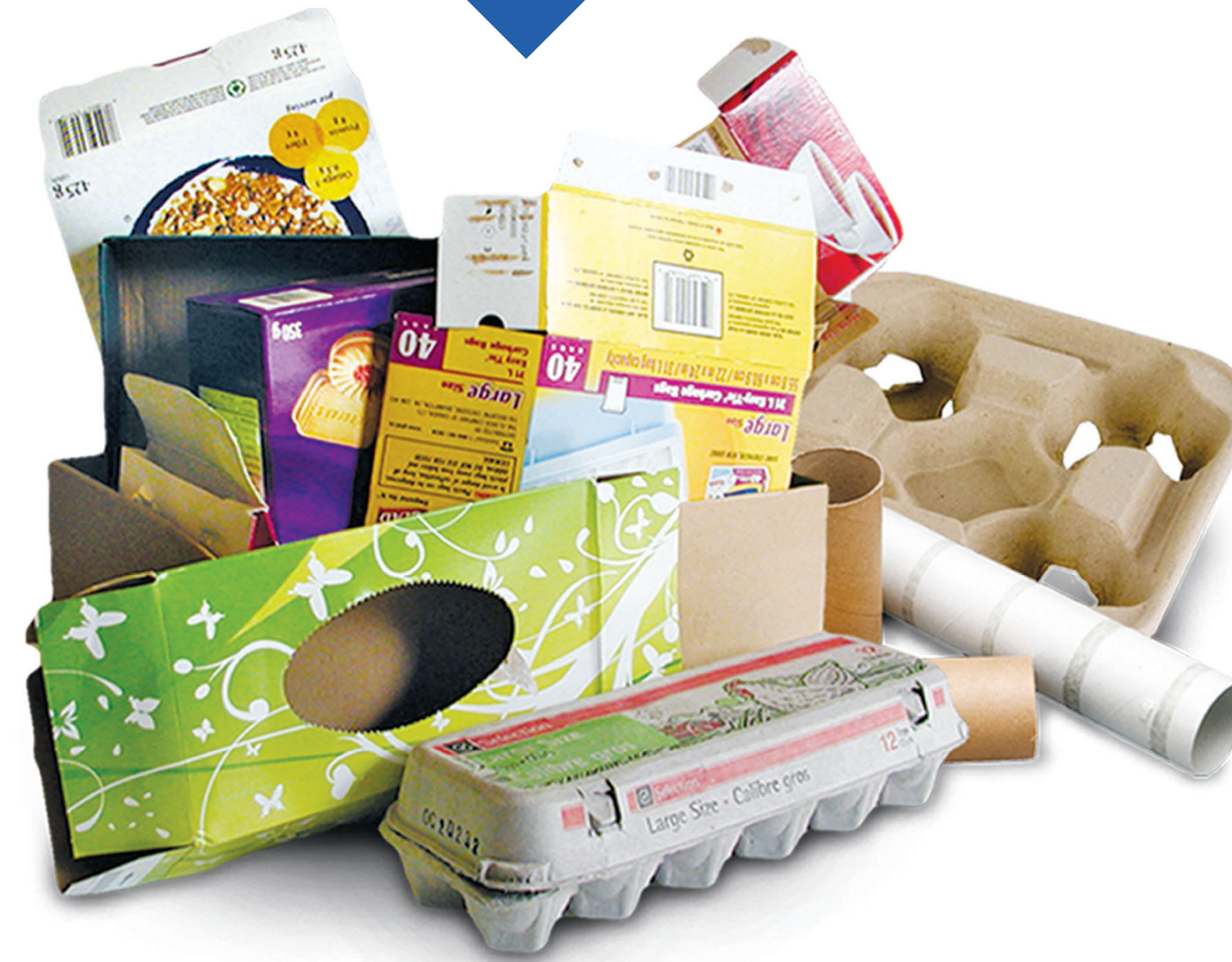
Boxes, egg cartons, tubes (flatten)